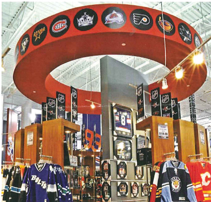
Groupe BO Concepts (GBC) Anjou, QC, Canada, fabricated a comprehensive environmental-graphics program for Pro Hockey Life (PHL), a Canadian hockey-equipment and paraphernalia chain. Each store's graphic focal point comprises a 22-ft.-diameter, red ring, which GBC decorated with NHL team logos using FLEXcon's BusMark film.

Creating customer buzz inside the store required a multifaceted plan as aggressive as a power-play surge toward the goal. A bright-red, 22-ft.-diameter, suspended ring hangs high above store shelves. GBC decorated the rings with the logos of all 30 NHL teams using FLEXcon's BusMark